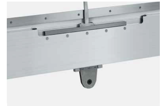
DRC 1E stud