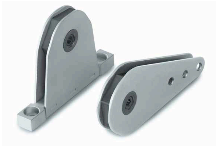
DRC 1E composite execution

High-quality, wear-resistant materials insure reliable, durable function with minimal maintenance requirements.