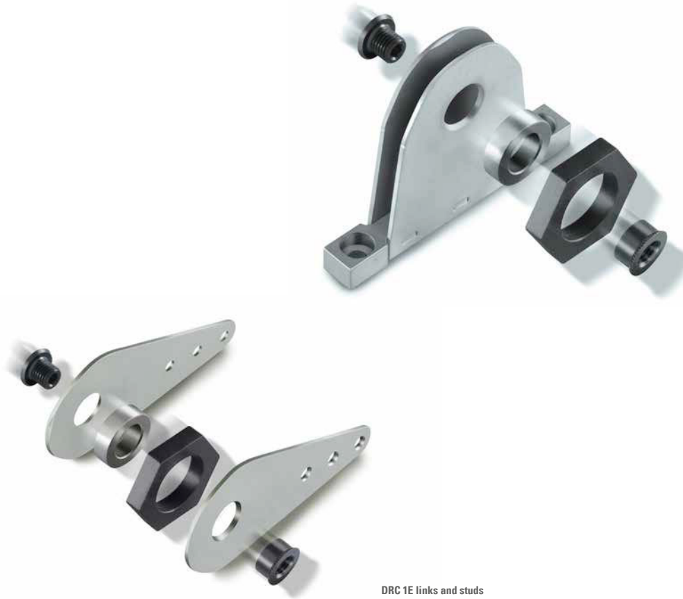
DRC 1E links and studs