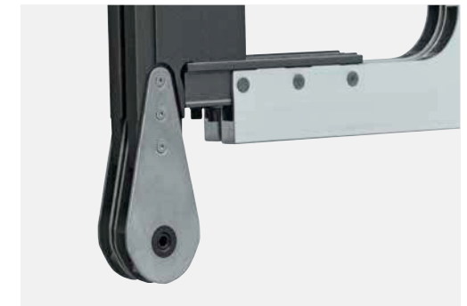
DRC 1E link